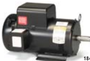
1 PHASE 184T FRAME