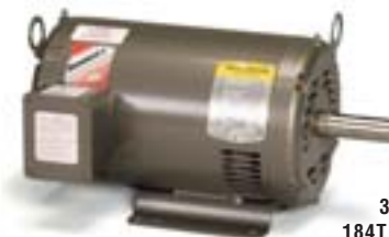
3 PHASE 184T FRAME