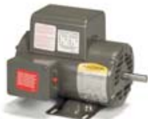
1 PHASE 56 FRAME